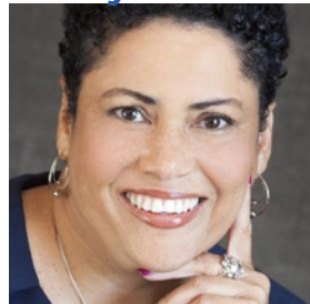
Pilot Volunteer Manager