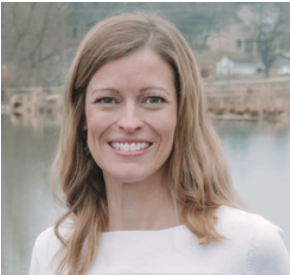
Volunteer Support Coordinator