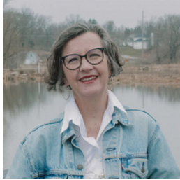
Founder Executive Director